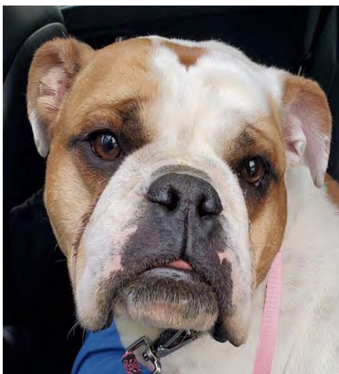
Pricilla - obstruction surgery