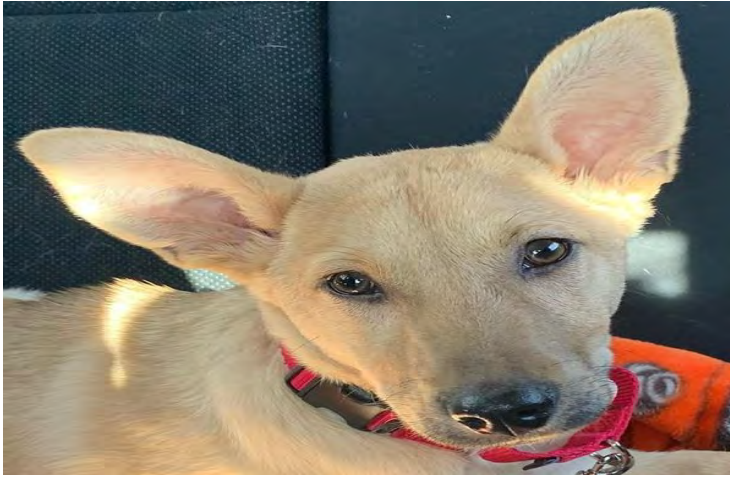
Chaco - heart surgery