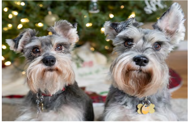
Dexter & Sweet Pea - dentals