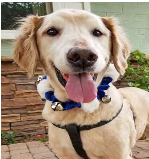
Kosmo - leg tumor removal