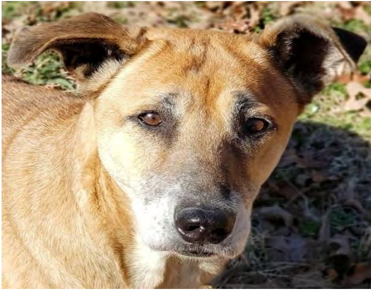
Princess - Heartworm treatment