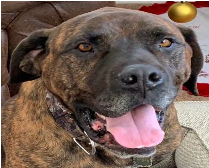
Tonka Trunk - digestion issues