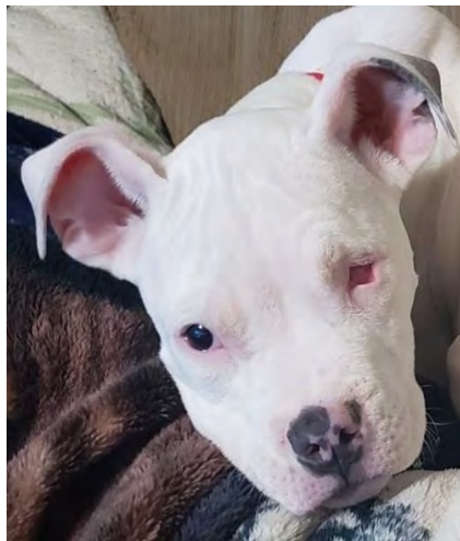
Boomer - parvo treatment