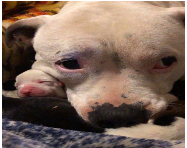
May & babies - foster expenses