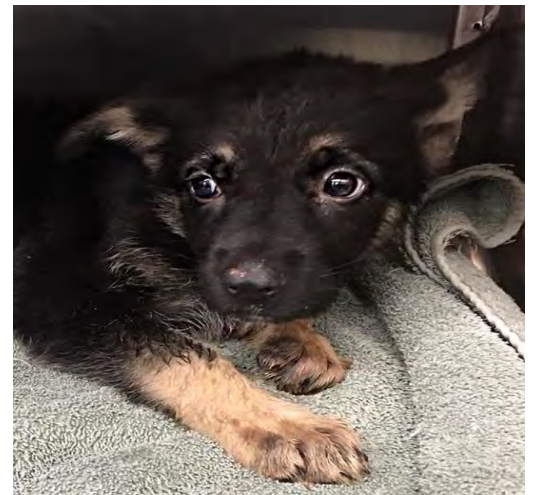
Nova - injuries