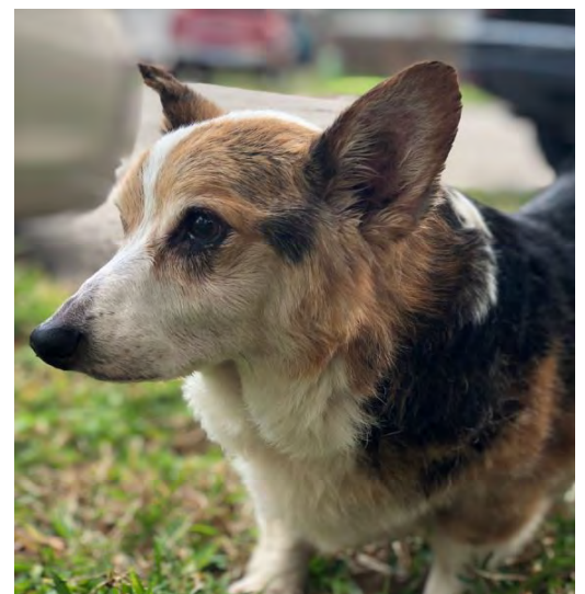
Darwin - physical therapy