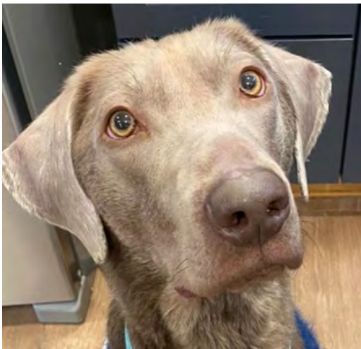
River - mega-esophagus