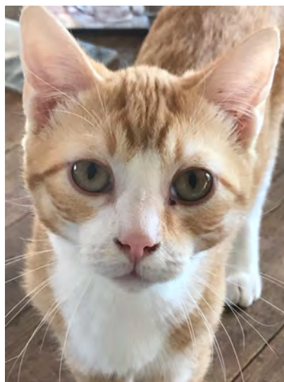
Mo - neuter