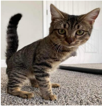
Wesley (leg amputation)