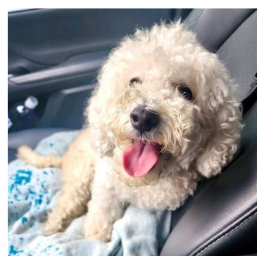
Betty White (bladder stone)