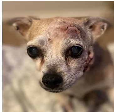
Blanche (tumor removal)