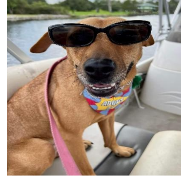
Rosemary (heartworm treatment)