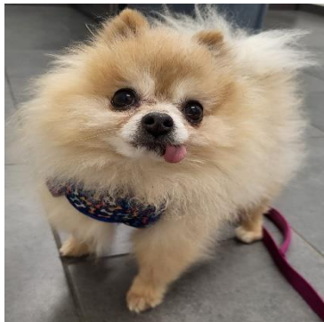
Jasper (heart / lung x-rays)