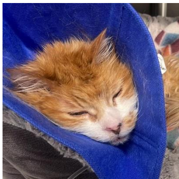
Bear (diabetes complications)