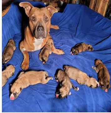
Patty Cake & 8 pups (foster care expenses)