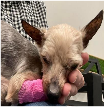
Bentley (leukemia medications)