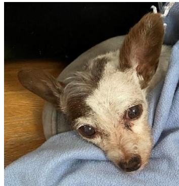
Snickers (senior vetting)