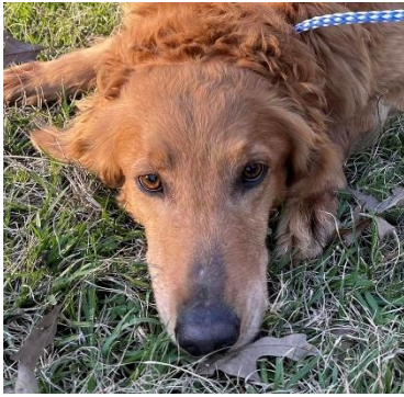
Ruby (breeder release / spay)