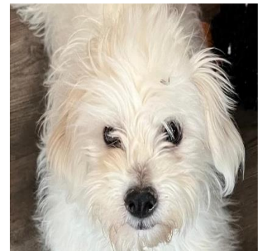
Kenzo (cardiology appt.)